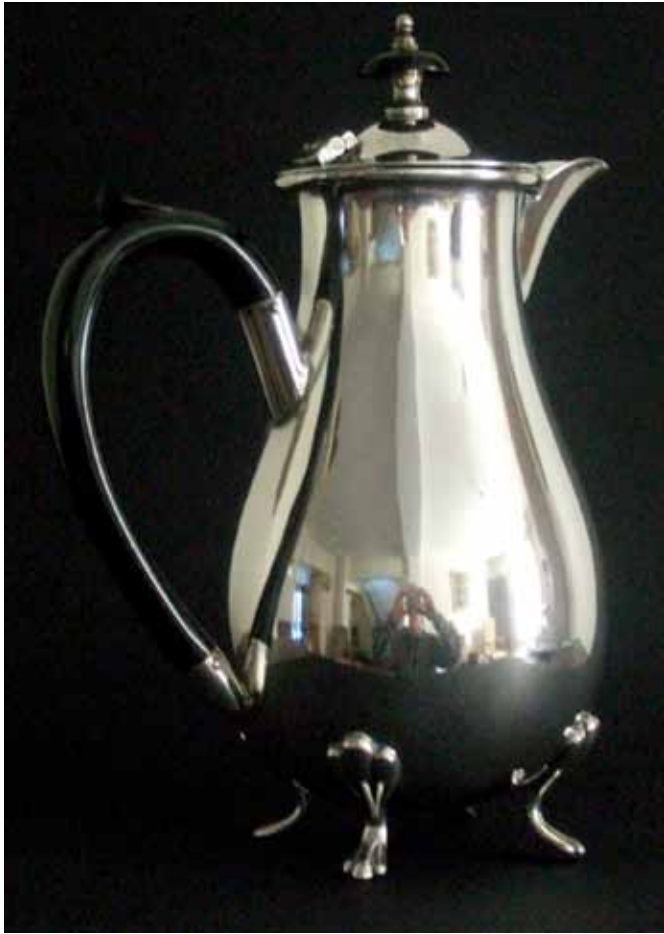
29. An Edwardian silver plated hot water jug with a ebony handle and knob. Circa 1910.