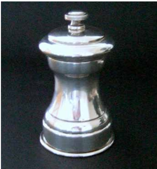
30. A silver plated pepper grinder.