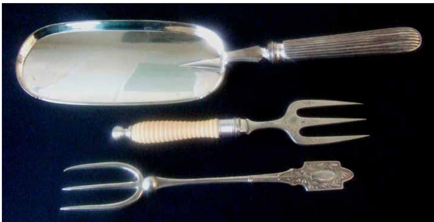
28. Top: An Edwardian silver plated crumb scoop, with reeded handle by Elkington Circa 1910.