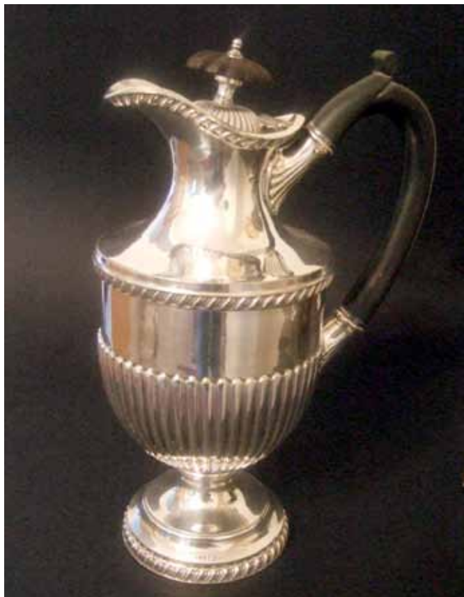
27. A Victorian silver plated pitcher of circular form for water or wine with half fluted body and pedestal foot – with an ebony handle and knob. Circa 1880.